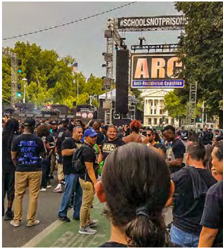
Imagine Justice concert July 21, 2017

have a parole hearing after 25 years of incarceration. SB 395 safeguards young peoples' constitutional rights by requiring that youth under 15 years old consult with counsel prior to waiving their Miranda rights.