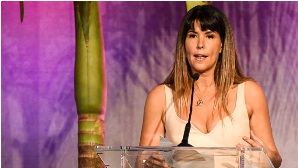
Wonder Woman director Patty Jenkins honored for work with ARC at Variety's Power of Women

In August 2017, Director Patty Jenkins reached out to ARC to co-host two screenings of her most recent film, Wonder Woman, at a juvenile camp for girls and a women's prison. Released just two months earlier on June 2, Wonder Woman earned over $800 million worldwide, making it the highest grossing live-action film to be directed by a woman. Patty, who has been a strong supporter of criminal justice reform since directing the 2003 film Monster, wanted to ensure that incarcerated women and girls had an opportunity to see Wonder Woman, and attended the screenings herself to speak to them about empowerment and overcoming adversity.