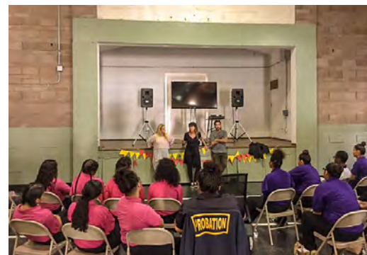
Wonder Woman Director Patty Jenkins at Camp Scudder on September 16

A few weeks after the screenings, on October 13, Patty shared her work in a very different setting at the Beverly Wilshire Hotel in Beverly Hills. The room was filled with actresses, producers, directors, and philanthropists. Variety Magazine had selected Patty as an honoree at its annual Power of Women event for her accomplishments and her work with ARC. At the event, Patty told the audience, "I didn't grow up thinking I would be all about prison, but once you get near it, you start to see the people who truly deserve another chance and they can't get it." She continued, "Everybody deserves to be that superhero, no matter whether they started out in a juvenile detention center or on the island of Themyscira. I'm excited to be a part of it."